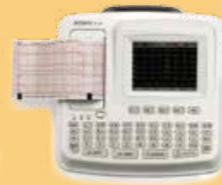
SE-601 Series Electrocardiograph