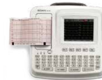
SE-601B (5.7" Color LCD Display)