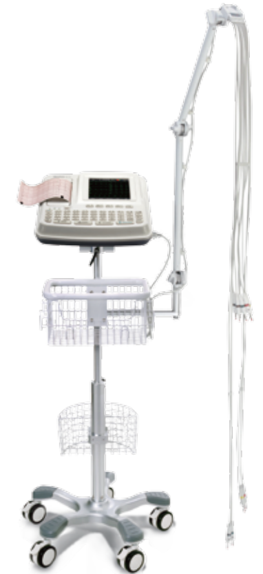
SE-601C With Rolling Stand (5.7" Color Touch Screen)