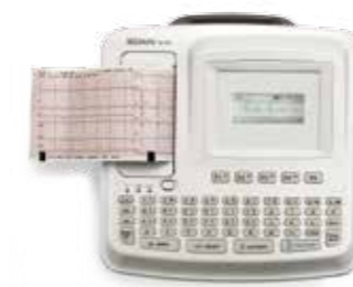
SE-601A (3.5" Monochrome LCD Display)